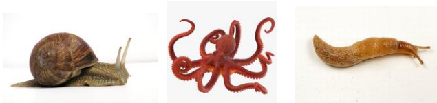
Snails octopuses snails