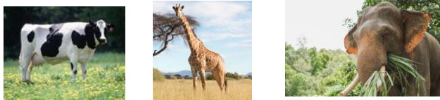
cows giraffes elephants

Animals that eat plants and meat are called omnivores .