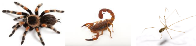
Spiders scorpions daddy long legs spider