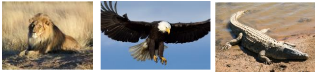
lions eagles crocodiles

Animals that only eat plants are called herbivores .