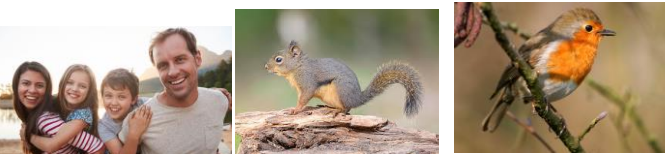
humans squirrels robins