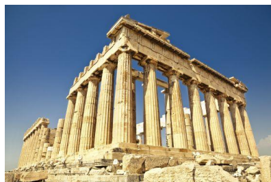
The Parthenon, an ancient Greek temple dedicated to the Goddess Athena